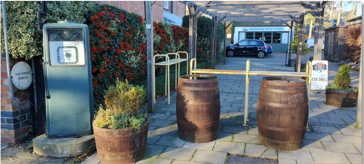
Broadway Barrels and Berries