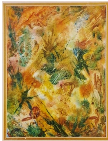
The winning artwork