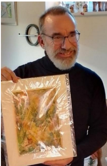
That's me, blathering on about criteria, Leonardo, etc.